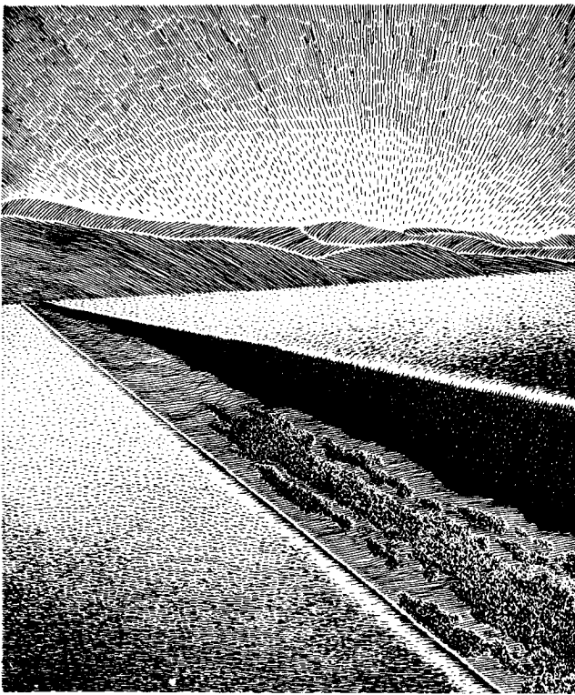
God opening the Red Sea, allowing the Israelites to escape.

God told Moses to go to Pharaoh and tell him to let the people of Israel go. But Pharaoh refused to let them go.