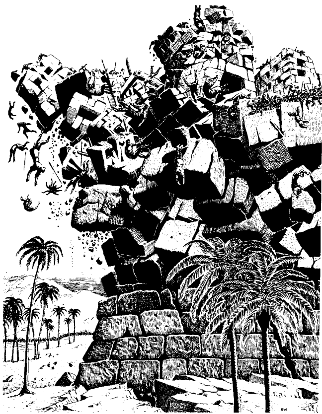
The walls of Jericho tumbling down at the final trumpet blast.

closed tight. The people had plenty of food and water, and the archers wouldn't even let the Israelites get close. God told Joshua: "I'm going to give you the city and all those who live in it. I want you to surround the city with all your soldiers and then march around it once each day for six days. Have seven priests go before the Ark of the Covenant with seven trumpets blowing. Then," God continued, "on the seventh day, march around the city of Jericho seven times. On the last time around, blow the trumpets with one long blast, and at the same time everyone will shout."