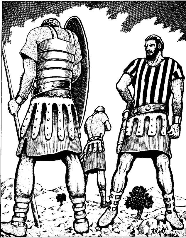
The people of Canaan were reported to be giants.

resurrected. These people will be given their first chance to learn God's laws and live their lives His way. For 100 years they will be judged accordingly.