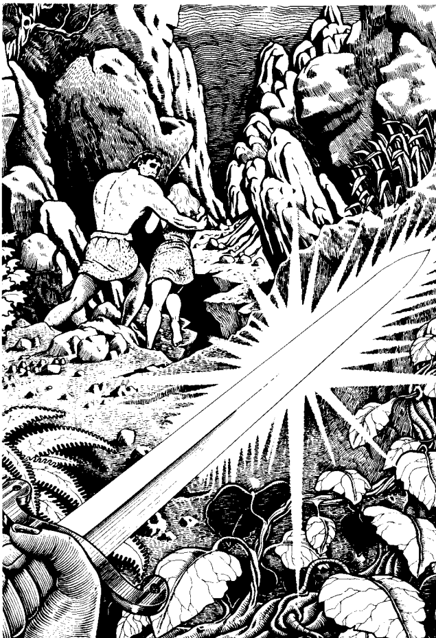
Adam and Eve being driven from the Garden of Eden for not obeying God.