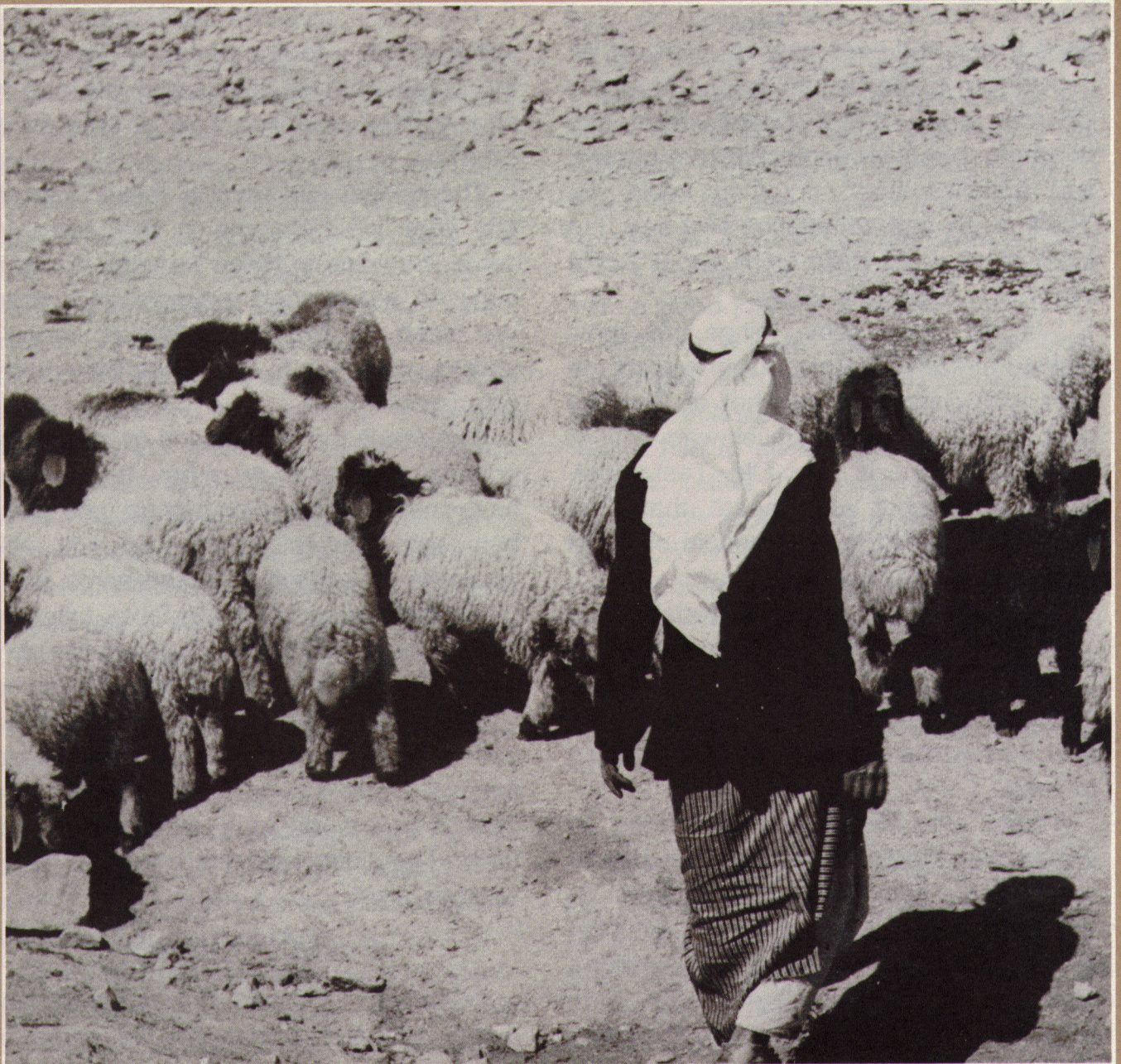
The Early Years